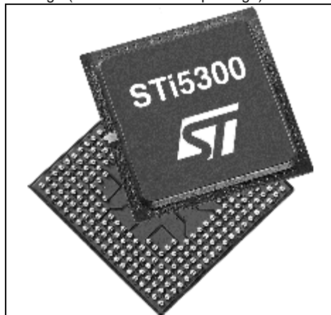
Figure 1. STi5300 low-cost interactive set-top box