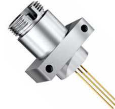
PD075-003-5xx FC Receptacle