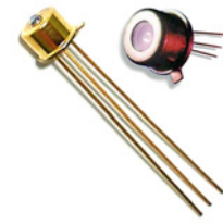
PD075-003-1xx TO can Package