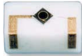
PD075-003-0xx Ceramic Sub-Mount