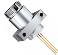
PD070-HL2-5xx FC Receptacle