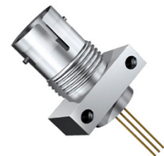
PD070-HL2-5xx ST Receptacle