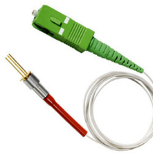
PD070-HL2-3xx SC/APC Pigtail