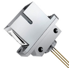
PD070-HL2-5xx SC Receptacle