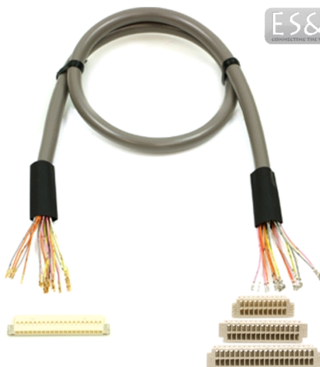
LVDS Display cable set

In the absence of confirmation by device specification sheets, ES&S Solutions GmbH takes no responsibility for any defects that occur in equipment using any of ES&S's devices, shown in catalogs, data books, etc. Contact ES&S in order to obtain the latest device specification sheets before using any ES&S's device. ES&S reserves the right to make changes in the specifications, characteristics, data, materials, structures and other contents described herein at any time without notice in order to improve design or reliability. Contact ES&S in order to obtain the latest specification sheets before using any ES&S's device. Manufacturing locations are also subject to change without notice. Observe the following points when using any device in this publication. ES&S takes no responsibility for damage caused by improper use of the devices. ES&S's devices shall not be used for equipment that requires extremely high level of reliability, such as: -Military and space applications -Nuclear power control equipment -Medical equipment for life support