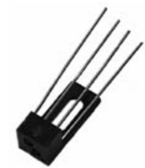
Representative photograph, actual product appearance may vary.

Due to regional agency approval requirements, some products may not be available in your area. Please contact your regional Honeywell office regarding your product of choice.