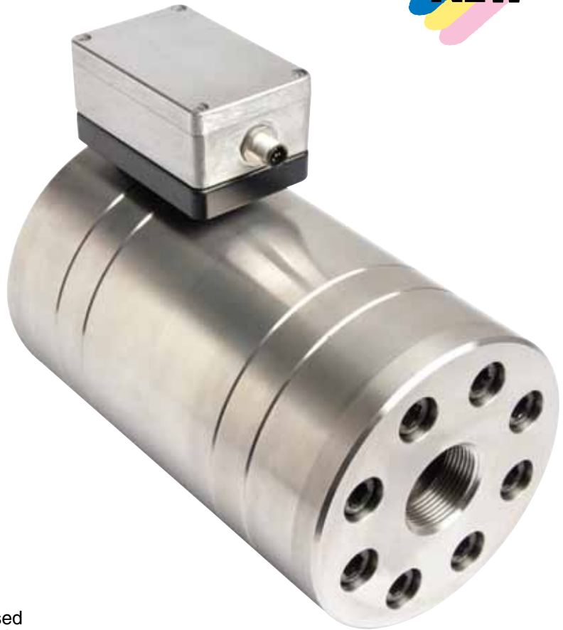
FHG-1000 shown smaller than actual size.

FHG-1000 flowmeters measure the flow rate based on the screw pump principle. A pair of rotors fitted precisely into the housing constitutes the measuring element. An integrated gear and non-contact signal pick-up system detects the rotations of the measuring element and converts them to digital pulses. Together with the housing walls, the rotor edges form closed measuring chambers in which the fluid is transported from the inlet to the outlet side. The fluid volume put through within one main rotor rotation is the rotation volume, which is divided by the sensing gear and digitized, processed and output in the sensor module.