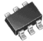
SOT23-6L -40°C ~ 85°C

The CP2128 are low noise, constant frequency switched capacitor voltage doublers. They produce regulated output voltage from a 2.7V to 4.5V input with up to 100mA of output current. Low external parts count make the CP2128 ideally suited for small, battery-powered application. A new charge-pump architecture maintains constant switching frequency to zero load and reduces both output and input ripple. The CP2128 have thermal shutdown capability and can survive a continuous short circuit from Vout to GND. High switching frequency enables the use of small ceramic capacitors.