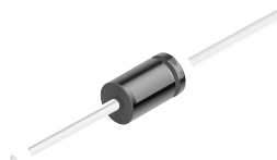
DO-35 Glass case