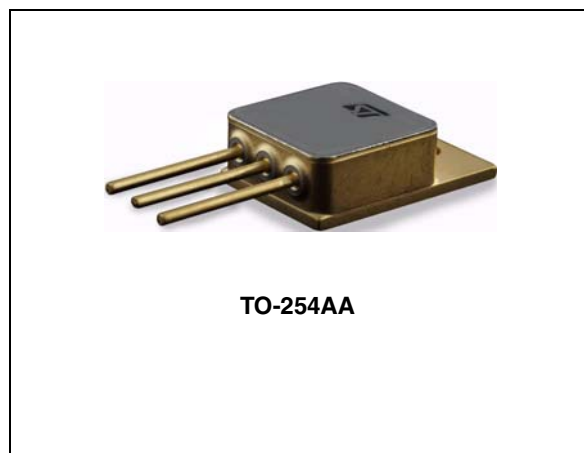
Figure 1. Device configuration

The complete ESCC specification for this device is available from the European space agency web site. ST guarantees full compliance of qualified parts with such ESCC detailed specifications.