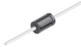
AXIAL LEAD (DO-35) CASE 017AG (Color Band Denotes Cathode)

Product parametric performance is indicated in the Electrical Characteristics for the listed test conditions, unless otherwise noted. Product performance may not be indicated by the Electrical Characteristics if operated under different conditions.