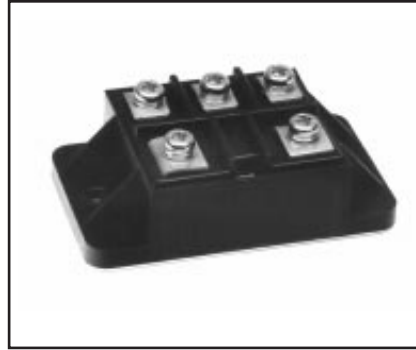
RM20TPM-24, RM20TPM-2H Three-Phase Diode Bridge Modules 40 Amperes/1200-1600 Volts